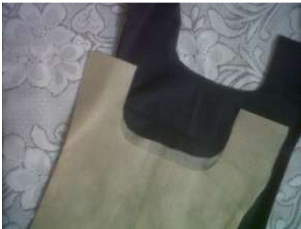
Illustration 3 – Cloth Bag type -2 made of synthetic material