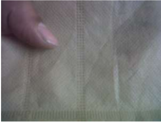
Illustration 2 – Cloth Bag type -1 made of synthetic material