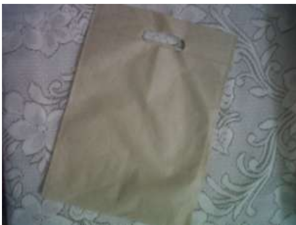
Illustration 4 – Cloth bag made of old saree/ chunni scrap