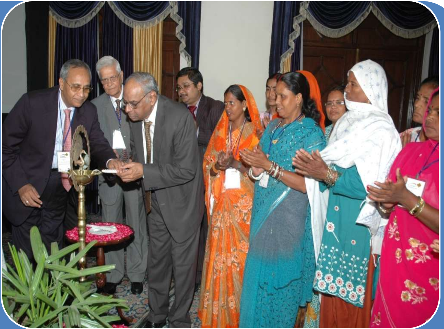
Inauguration of workshop by Dr. C. Rangarajan -Chairman, Economic Advisory Council to Prime Minister and members of Self Help Groups