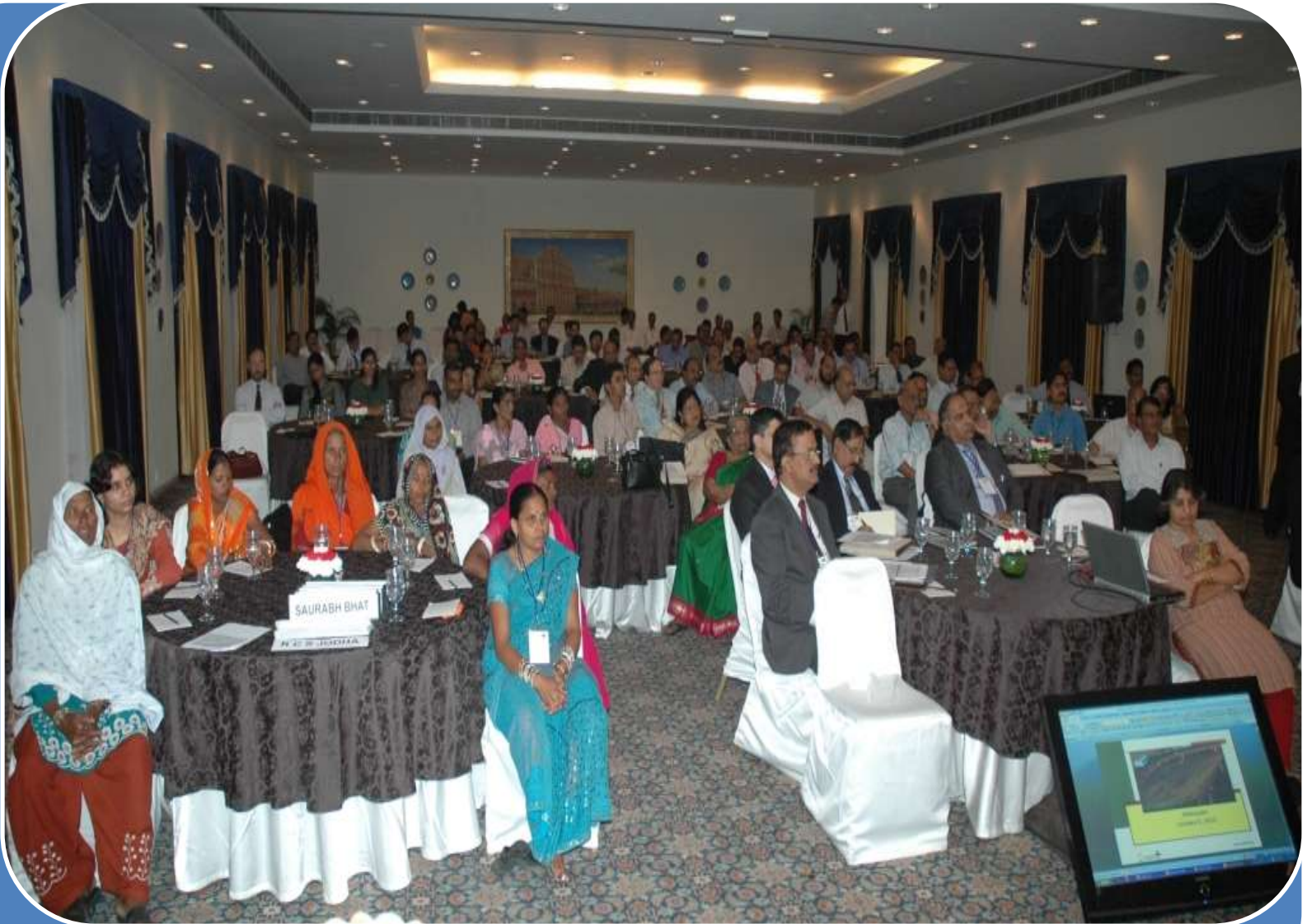
Participants at Bankers' Conclave