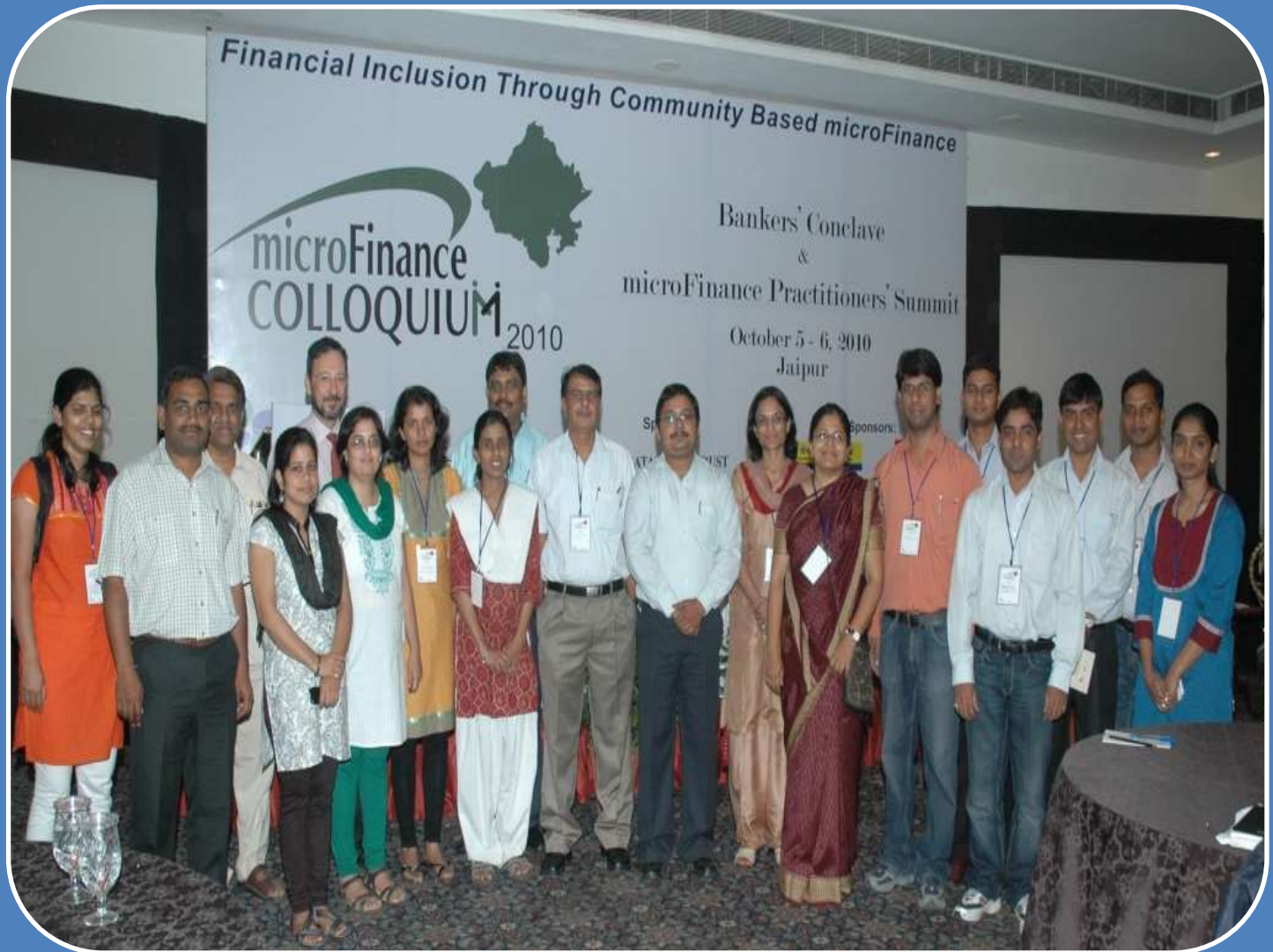
The CmF & SRTT team